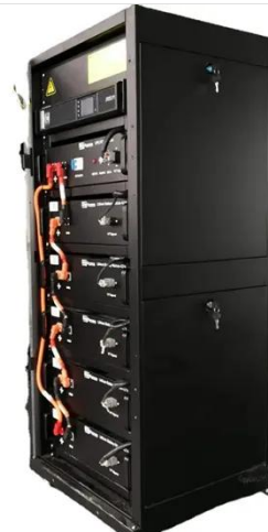
ABB 4943013-6 PLC Battery 3.6v Lithium

This non-rechargeable aftermarket lithium battery replaces ABB 4943013-6 batteries for programmable logic