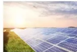
Energy Storage System