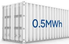
Standard 20ft containers